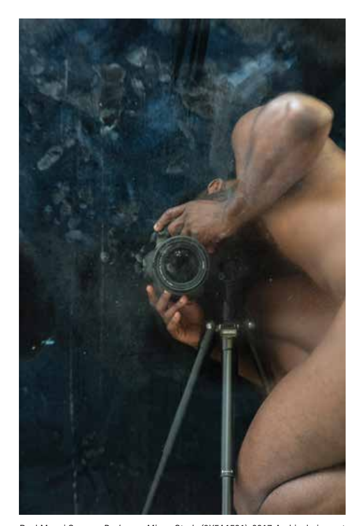
Paul Mpagi Sepuya, Darkroom\ Mirror\ Study\ (OX5A1531) , 2017. Archival pigment print, 34 x 51 inches.

In combination with the drapery, Sepuya also uses mirrors as a surface to make visible the fingerprints and traces of touch that occurred before. As the artist states, "Nothing is hidden... There is the 'dark room' spaces, created within the drapes of the black and brown velvet...that space created is a world in its own, and only its darkness, or the black of the camera body and tripod, or my own body, can throw into view the latent traces on the mirror's surface. We must allow ourselves to privilege darkness, and blackness, as requisites for vision." Sepuya's artistic practice is thus one of constructive desire: to photograph, to look, and to touch.