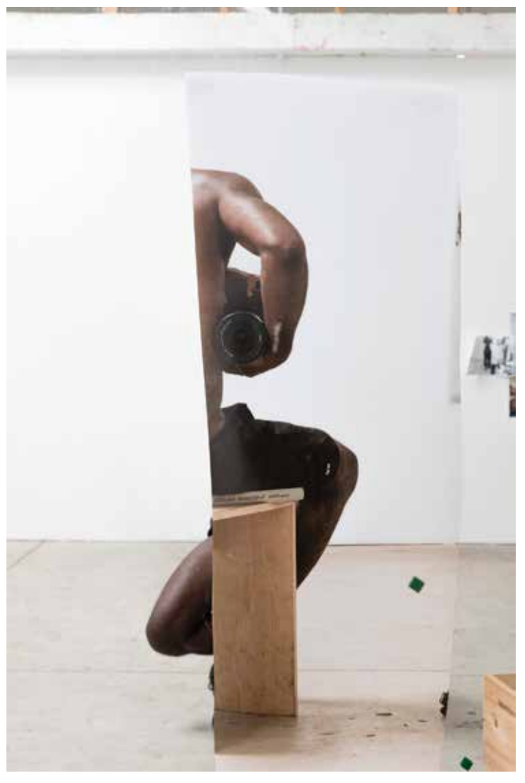
Image: Paul Mpagi Sepuya, Mirror Study (0X5A1317), 2017. Archival pigment print, 51 x 34 inches. Courtesy the artist; DOCUMENT, Chicago; team (gallery, inc.); and Vielmetter Los Angeles.

Sepuya's current practice is largely grounded in the studio as a site through which people, objects, and experiences are translated into material that is positioned, related, and reworked. This work began as early photographs and self-made zines produced in his Brooklyn home and while participating in a series of formative artist residencies. Photographs often depict formal sittings or remnants of exchanges between the artist and others, creating a simultaneous presence and absence. Upon Sepuya's later move to Los Angeles, the studio became a more grounded site through which materials pass at a steady pace. This, in turn, also leads the artist's work to grow more complex and