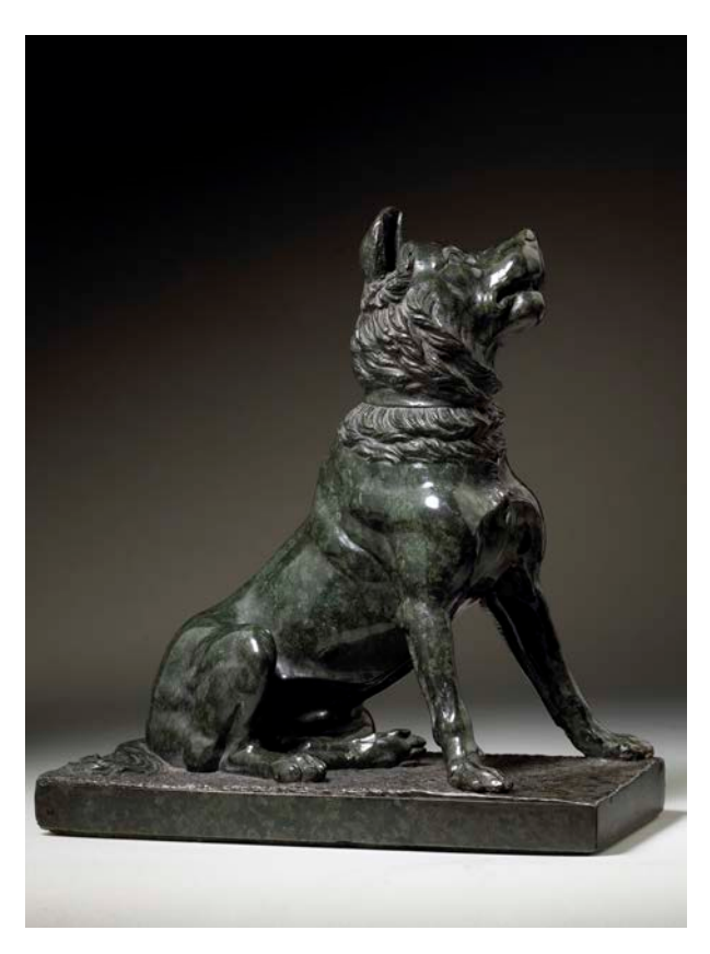
Iris Touliatou. A Model of the Dog of Alcibiades, temporary loan from the Sarah Campbell Blaffer Foundation Collection (MFAH) object number BF.2019.7, Benjamin Moore 1614 Delray Gray paint, Mercury Security card reader, UH Cougar card access, pedestal. Dimensions variable. Courtesy of the artist and Rodeo Gallery. Photo: Sarah Campbell Blaffer Foundation.

Chiffon Thomas, Gresham, 2022. Bible skins, thread, 9 x 11 x 12 in. Courtesy of the artist.