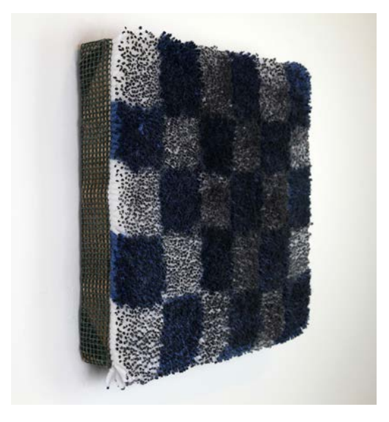
Anna Mayer. Pale Clay (Unknown Grid 8), 2022. Hooked rug with dyed canvas and inked tips, mounted on wood panel, 16 \times 12 \times 2 1/2 in.

Anna Mayer 's (b. 1974, Macomb, Illinois; lives and works Houston) sculptures are in dialog with pre- and postpetroculture by collapsing the distinction between the above and below of the Earth's surface, a characteristic trait of fracking seen in various landscapes throughout Texas. Each work uses what Mayer calls "funeral fringe" to penetrate photos sourced from a United States Department of Agriculture database of Texan landscapes and various moments of its induced fracturing. Mayer also presents a latch-hooked replica of a painting by Paul Klee. When the artist's mother passed away in 2016, she was knitting excerpts of paintings by Klee, her favorite painter. Mayer took her mother's patterns and latch-hooked them, the grid of this fiber process replacing the grid of the knit versions.