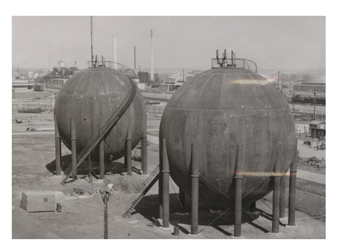
Clémence de La Tour du Pin. TPC Group [Modifications and Additions to Process Facilities], 1953. Historical photograph on loan from Special Collections UH Libraries, 8 x 10 in.

Two new works by Clémence de La Tour du Pin (b. 1986, Roanne, France; lives and works in Paris and Amsterdam) approach embodied experience through scent, archive, and institutional memory. One work features an arrangement of personal archival material, propaganda material, and photographs sourced from the oil and gas industries archives within the Special Collections at the University of Houston Libraries, while the other is a series of wax casts of handmade glass bottles. The use of beeswax and sealing wax, alongside a specially produced scent containing sulfuric notes embedded within the material, extends the work's exploration of bodily infestation to ideas of containment and the distortion of various materials.