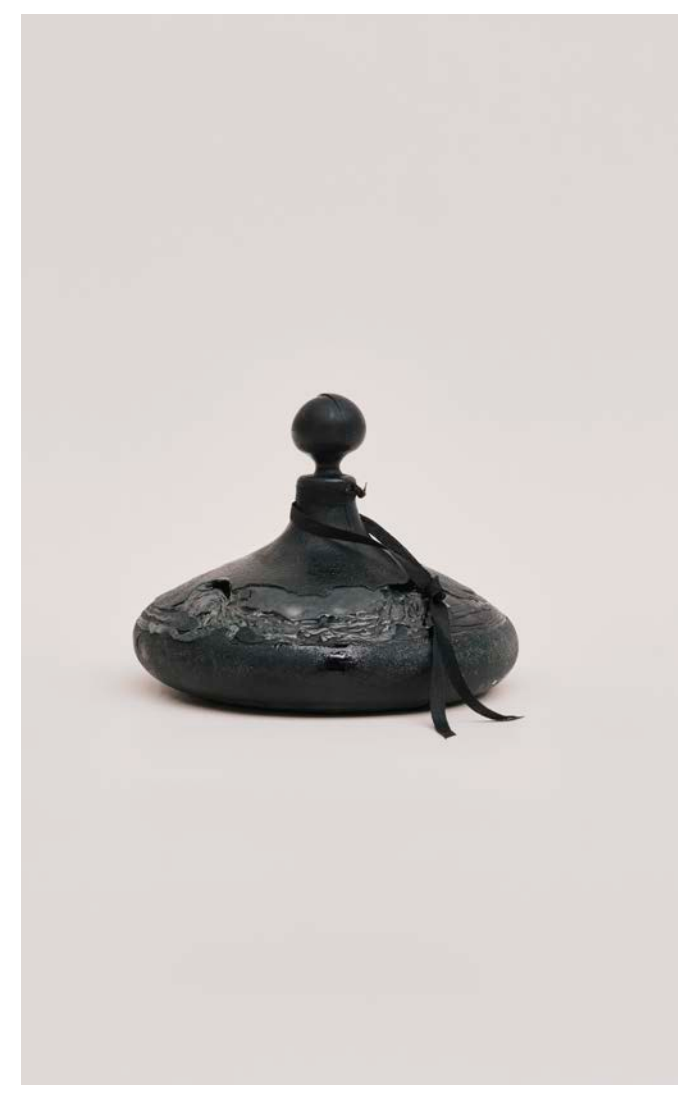
Clémence de La Tour du Pin. Peculiar Sweet Matter , 2023. Beeswax, pigment, oil substance, silk, thread, 5.9 x 5.9 x 3.9 in. Courtesy of the artist.

Drawing from Houston's drainage network and storm systems management, Kate Newby (b. 1979, Auckland, Aotearoa New Zealand; lives and works in Floresville, Texas) created a project comprising a series of cast-iron grates fabricated at a foundry in the town where she lives. The works are installed in three transitional locations in and around the Blaffer: the museum entrance, the loading dock, and the courtyard. These site-specific works mark the junctures between above and below ground, serving as conduits for channeling rain and floodwaters. Over time, the cast iron will gradually brighten as the material weathers. Moreover, Newby's distinctive, hand-cut openings and holes are an invitation to look closer, bringing a very intimately crafted form and viewing experience to the public sphere.